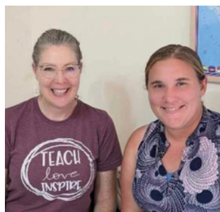
Shadow a Missionary