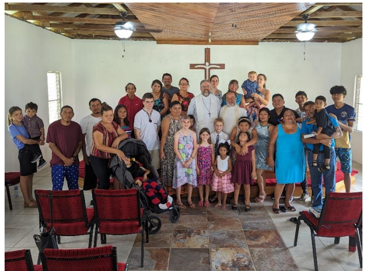
¡Cristo ha resucitado! ¡Aleluya!

On Easter Sunday, we celebrated our Risen Lord's resurrection, both in English and in Spanish. Between the services, our English-speaking congregation and Spanish-speaking congregations had the chance to meet one another. It was an awesome visual seeing the different languages and different cultures coming together as one body in Christ!