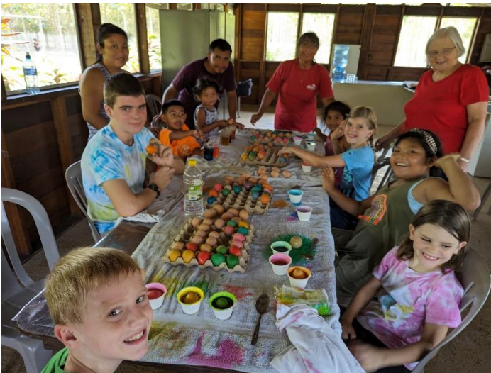
Enjoying Easter egg coloring at Camp Concordia on Saturday afternoon.

At Camp Concordia, we had fun coloring Easter eggs, playing volleyball, and going down to the Belize River. Sharing meals together was also a blessing, as the conversations blossomed into new friendships.