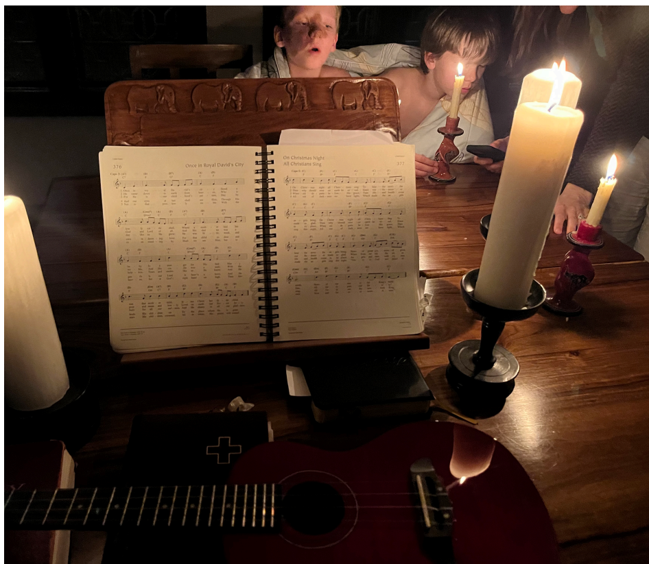
Celebrating Our Lord's incarnation-Christmas Eve Candlelight Service