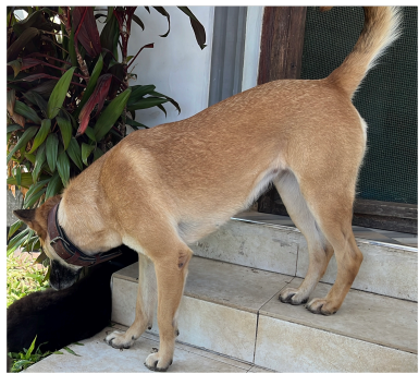
One of our new security dogs.