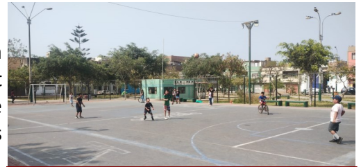
Outdoor sports and games in the local park are a regular part of our summertime activities at Castillo Fuerte

Summertime, Suntime and Funtime! The kids in the La Victoria neighborhood are enjoying spending their summer vacations at Castillo Fuerte Mercy House. This year our staff has prepared a whole new set of fun workshops and activities for the kids. In the mornings kids ages 6-11 have sports, crafts, mini chef, theater, English and bible class.