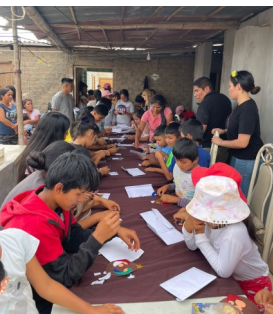
Bible Stories and Crafts for the kids