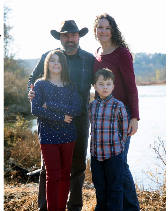
Family Photo at Camp Lutherhoma in November