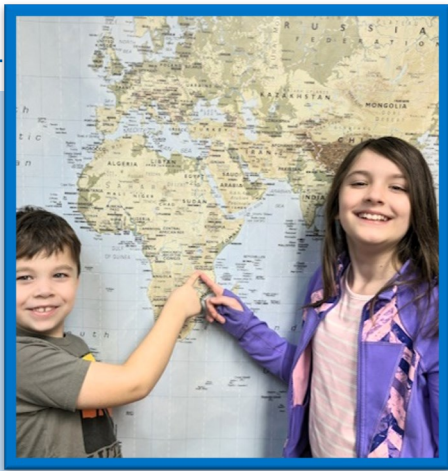
The children found Tanzania.