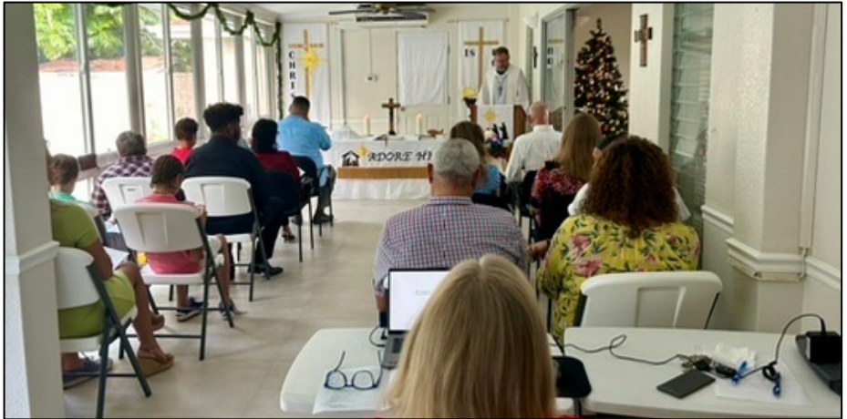
A full house on Christmas Day! Teaching seminary students online in Spanish (below).