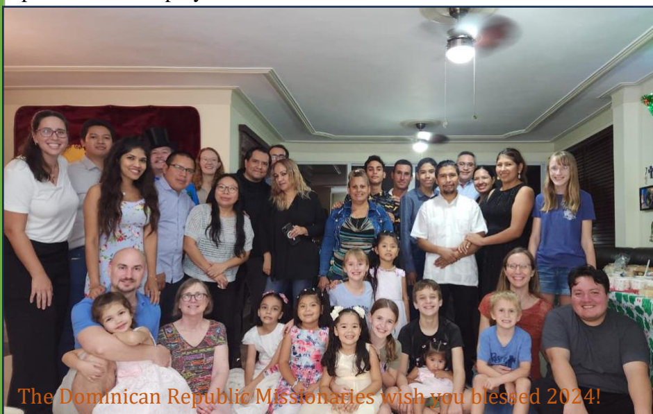
The Dominican Republic Missionaries wish you blessed 2024!

In addition to their seminary academic courses, the seminarians participate in chapel services, teaching catechism, and evangelistic efforts throughout the week. Thus they will be equipped as church planters. Please pray for these workers of the harvest.