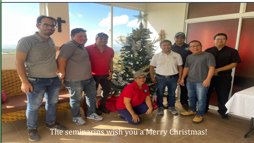
The seminarins wish you a Merry Christmas!