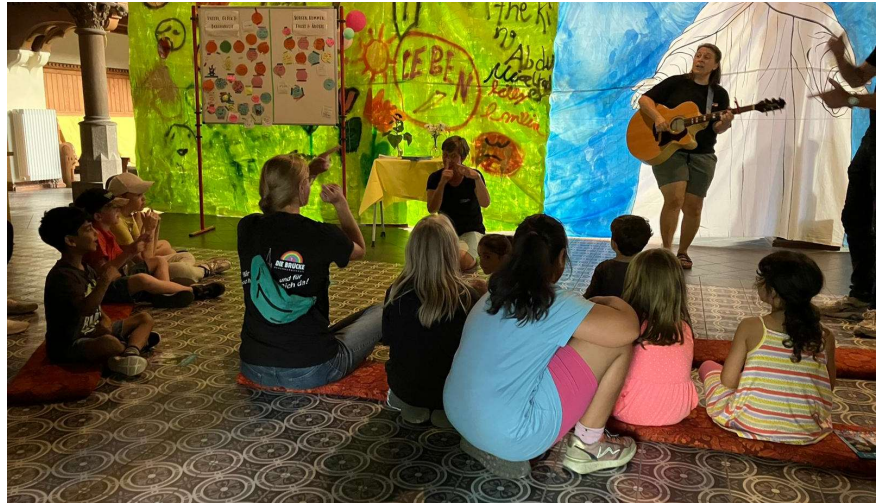
Leading songs with children at our neighborhood festival

As we prepare to celebrate the greatest blessing that God has given us through the birth of our Savior Jesus, I am reminded of the many blessings of this past year. Things seem to be back in full swing at Die Brücke, with many new faces, as well familiar ones. We continue to teach God's Word and rejoice when newcomers are baptized into Christ. We attend to daily needs and celebrate with our people when they are granted asylum or finally find a job or an apartment.