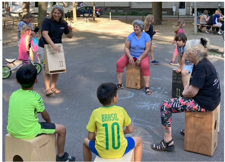
Teaching cajon rhythms at the neighborhood festival