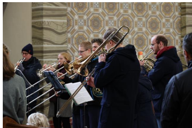
Music from the brass group.