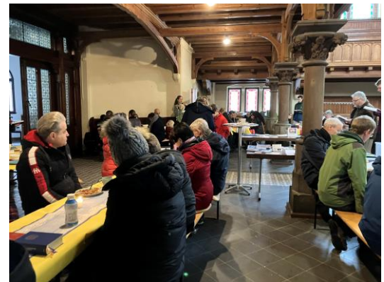
The group participating in the hymn sing.

On December 3 rd , the congregation had a little celebration to kick off Advent and the new church year. There was Persian and German food, a recap of the previous church year, music from the brass group, and some hymn singing.