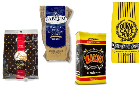
Dominican coffee, Jamaican coffee, Puerto Rican coffee, Panamanian coffee...