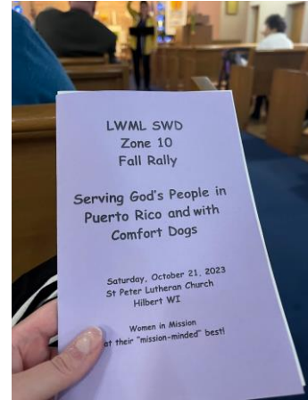
Thank you, to Zone 10 of the South WI District LWML