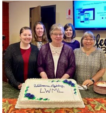
Thank you, Redeemer Lutheran Church, Green Bay Wisconsin