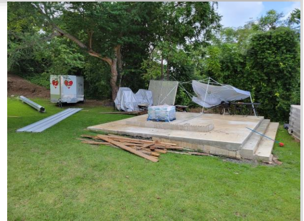
Above: Before Below: After

The day after the team of volunteers left to return home, the men of the church gathered for a bible study and used the new outdoor kitchen for a meal. A few weeks later as we celebrated Thanksgiving together as church family, Carlos a member, made the turkey two ways in the outdoor kitchen. What a blessing it is to have this space. Our usual activities outdoors are Friday bonfires and the men's bible study time with a barbeque. These are easy opportunities to invite friends to come and enjoy some fellow. We are planning new ways to invite the community to our church and to use our outdoor space now more with the new outdoor kitchen.