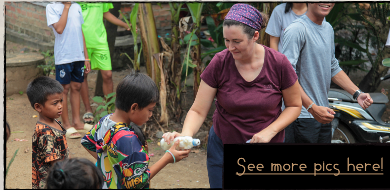
See more pics here!