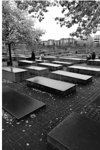
The Holocaust Memorial.