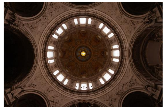
The interior of the Berliner Dom, the Berlin Cathedral.