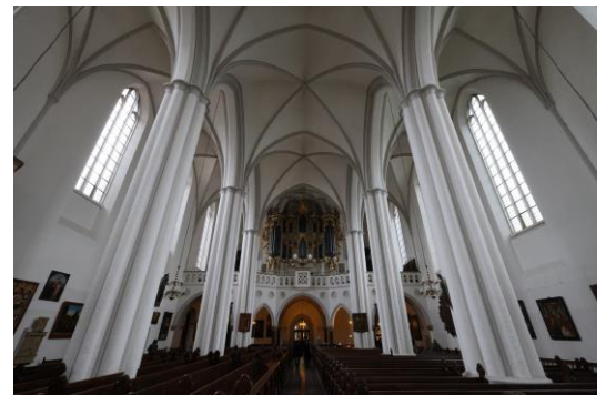
The interior of Marienkirche, St. Mary's Church.