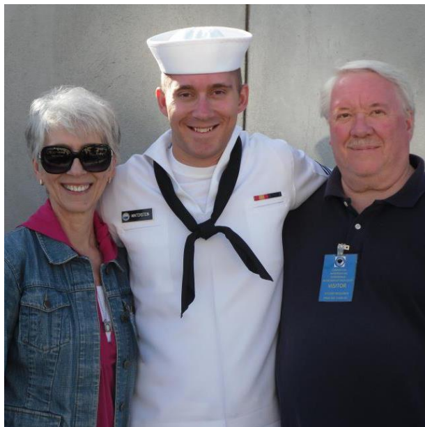
My parents and me, shortly after I arrived at the Defense Language Institute in 2012.

There are two reasons I've added a picture of me and my parents at DLI, and they're related to this important update: I've decided not to extend my term of missionary service here in Leipzig.