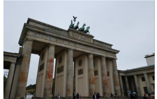
The Brandenburg Gate.