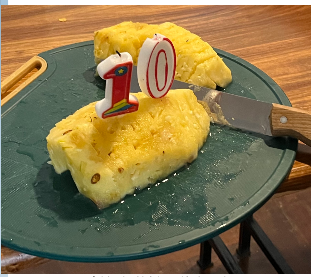
Celebrating birthdays with pineapple.

Much of our work this year is figuring out how to live in a new country. With our newsletters this first year, we are giving little glimpses into life as a missionary even as we ourselves figure out how to live. Our title today will share a little of how living in Tanzania affects our family culture. The second part of the title