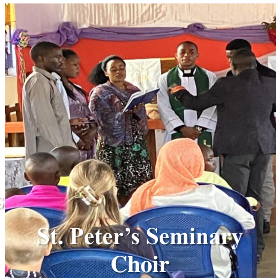
St. Peter's Seminary Choir