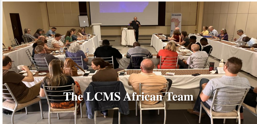
The LCMS African Team