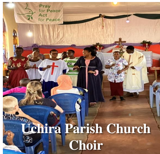
Uchira Parish Church Choir