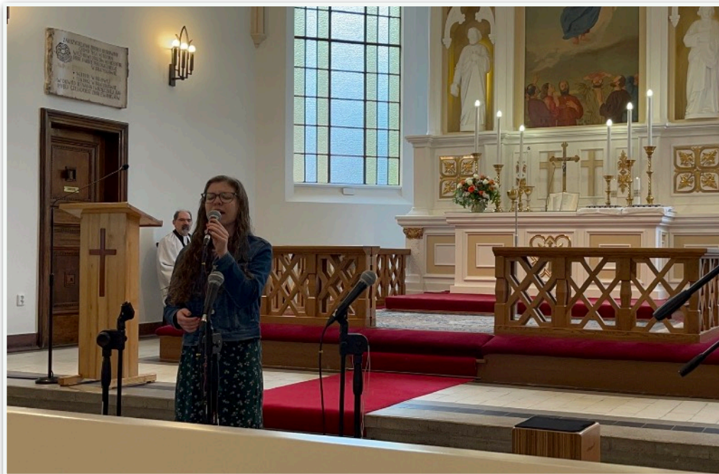
Above: Me, singing during the church service in Cesky Tesin

In high school and college, I often sang at my home church in Nebraska on Sunday mornings. I had sang a few times when I lived in Bohumín and really enjoyed it. So naturally, when my pastor in Cesky Tesin asked me to sing, I happily agreed. I rehearsed with the guitarist and came early on Sunday morning. The lyrics to the songs were translated and put on the screen for people to read. After church, my pastor thanked me and asked when I would be willing to sing again and if I would be able to sing in Polish. I thank God for this opportunity to be involved in the church service.