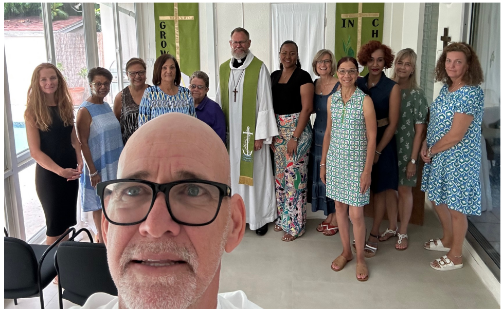
Our flock at Safe Harbour after the Divine Service.