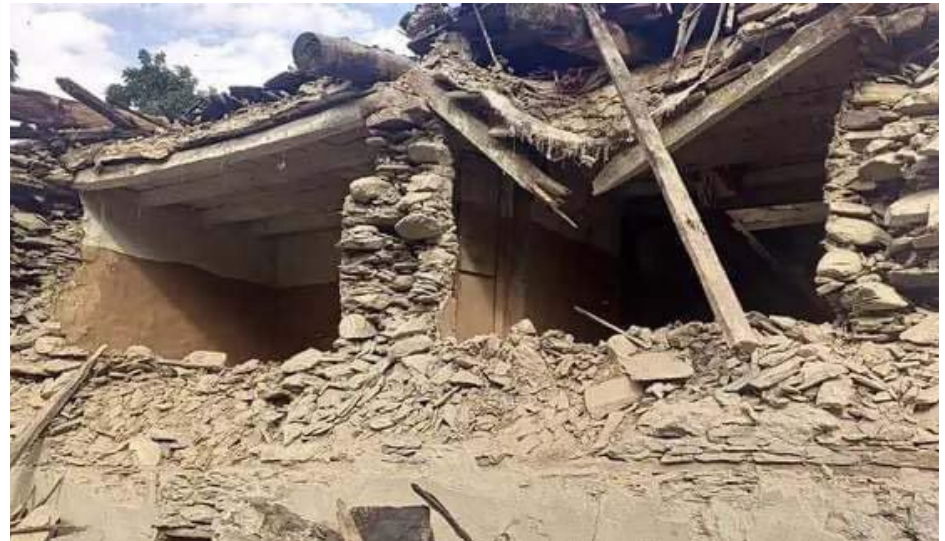
One of our students supplied this photo of the devastation in Nepal following the recent earthquake.

Information from: Kaiņš, Guntis. The Passport of Latvia . 2 nd Ed. Bārbala Simšone (trans.). Rīga, Latvia: Apgāds Zvaigzne ABC, 2019.