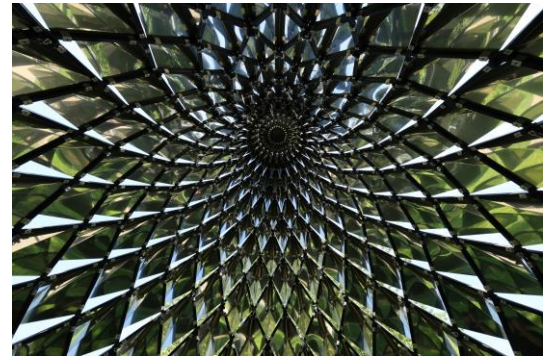
The interior of a large sculpture in Jurmala, whose name is "The Cone" (as in pinecone).