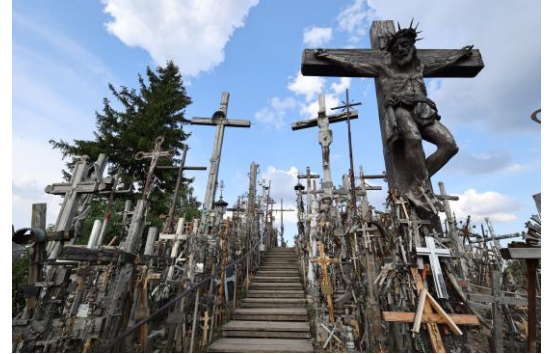
The Hill of Crosses in Lithuania, where approximately 200,000 crosses of various shapes and sizes reside.