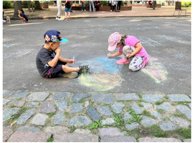
Kids draw with chalk on the pavement in front of the church doors.