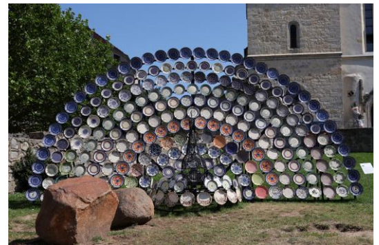
A peacock made of pottery, in a Polish town whose region is known for its handmade dishes.