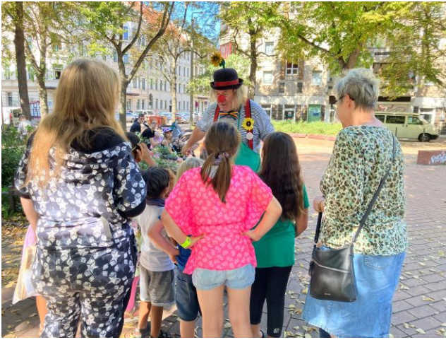
There was a clown who played games and made balloon sculptures.