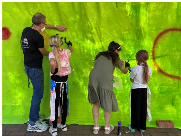
Pastor and one of the Persians help a couple of girls paint "graffiti" on a large canvas.

I've been in Leipzig for just about a year now. Shortly before I arrived last year, the church and die Brücke held the annual Stadtteilfest (Stadtteil is the German word for neighborhood, literally "city part"), a daylong neighborhood block party for people in the area. This year, it was decided that this one-day festival would be extended to a week (thus, the change to Stadtteilwoche), with lots of food, activities for children and adults, and Bible lessons. We're trying to keep that momentum going throughout the year, with more open hours during the week at both the church and Brücke.