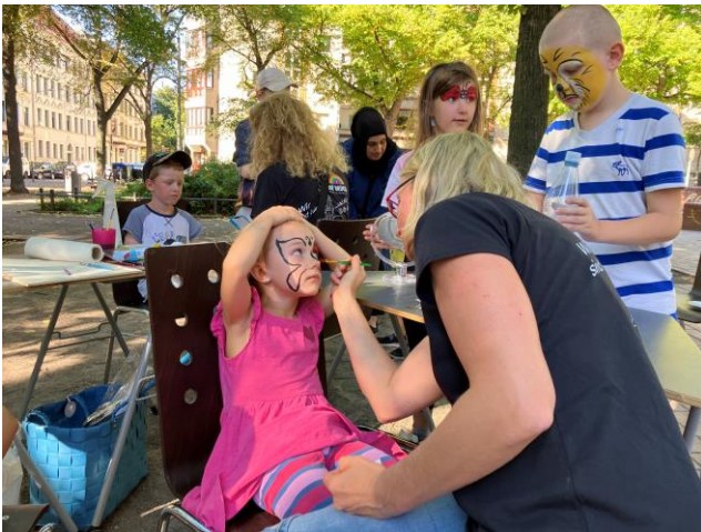
Several ladies from the church devoted hours to face-painting masterpieces.