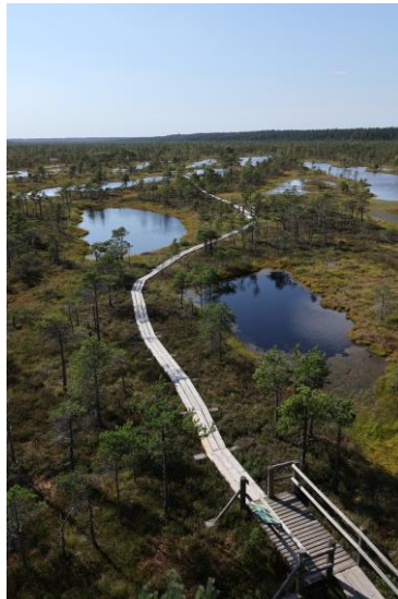
From a tower overlooking a large wetland, not too far from Jurmala.

-The arrival of fall and cooler temperatures