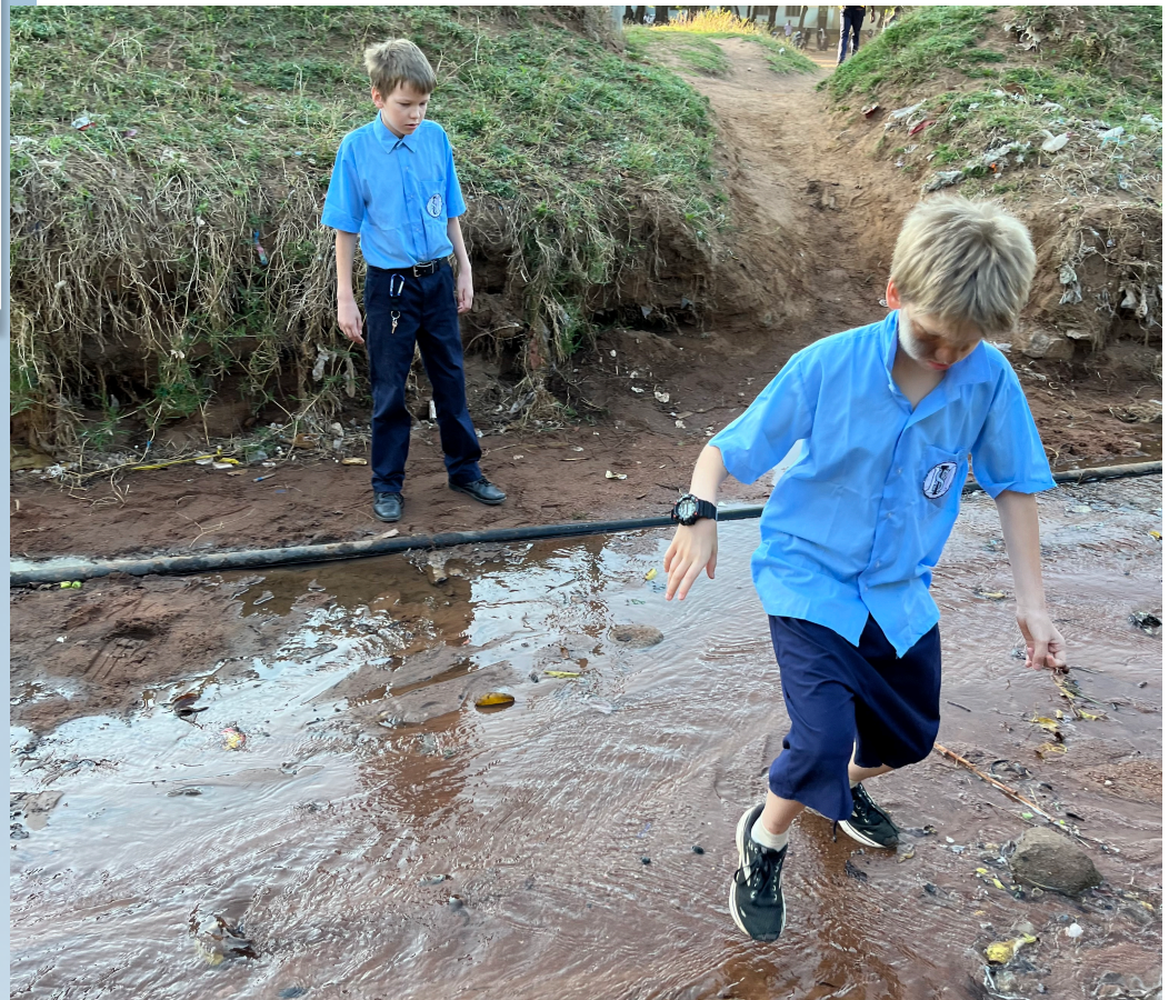
Crossing a canal on the way to school.

To be added to or removed from this mailing list, send an email message to jason.steffenson@lcms.org with the word ADD or REMOVE in the subject line.