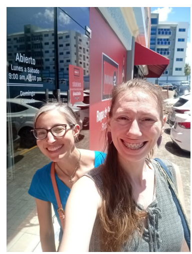
Above: Thrifting with a friend from the capital who came to visit—the first overnight guest in my new/old house.