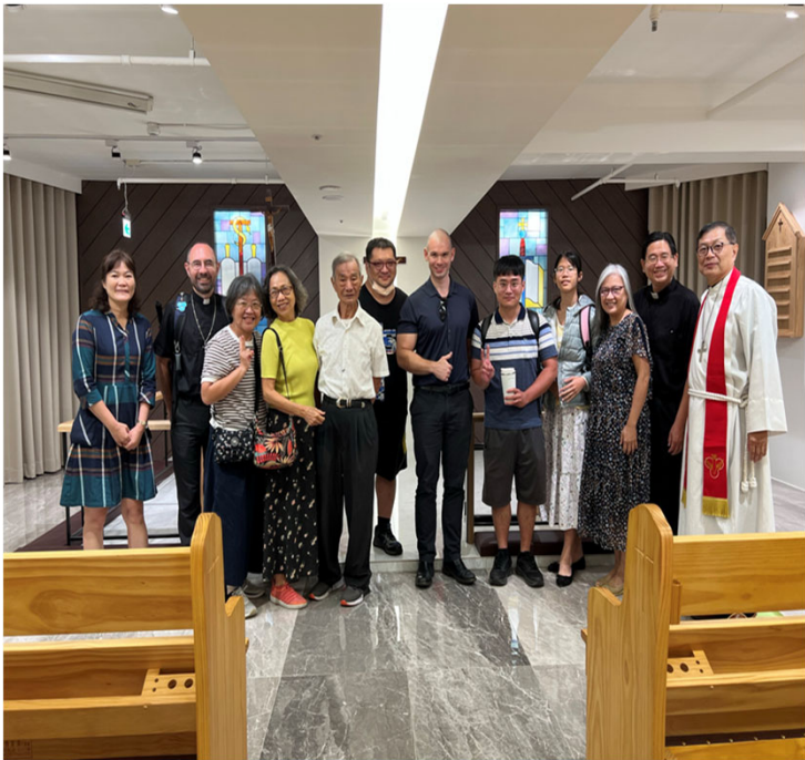
Celebrating a successful church dedication in Hsinchu, Taiwan. Soli Deo gloria!