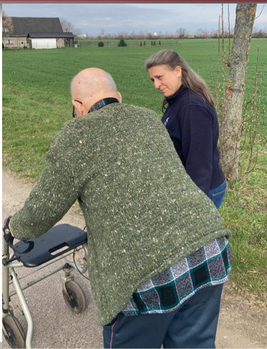
Visiting with a 94-year-old congregation member