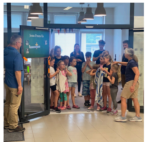
Below: Participants and volunteers playing games, having fun and building relationships.

Interested in serving next summer? Visit servenow.lcms.org to find opportunities as they get scheduled.