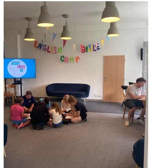
Above: Children learn about Jesus during the Bible lesson.

Join us in thanking God for new connections within the community, for children and parents hearing that Jesus has freed us all from sin, death and the devil and for all those who helped to make EBC possible in K4 and at the four other congregations in Silesia. Pray that the seeds planted would grow and that more Czechs would come to know Jesus as Lord and Savior.