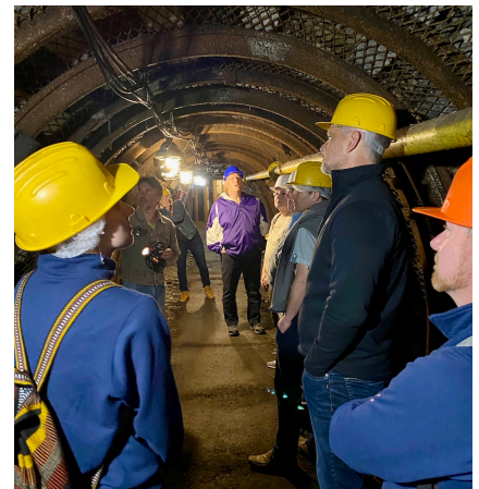
The team experiences the life of a coal miner, a major profession in Czech Silesia, to help them better relate to the community.