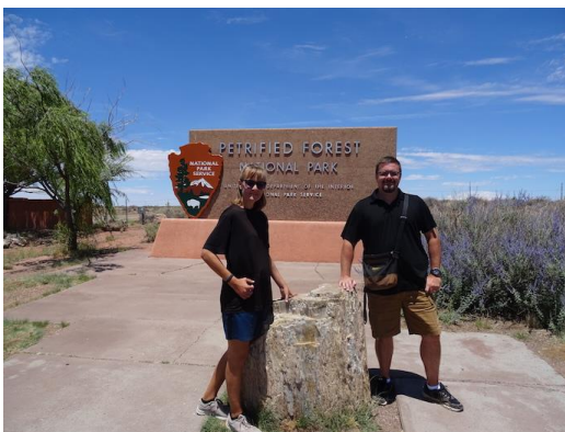
Activities this summer in Arizona and Valentine, NE.