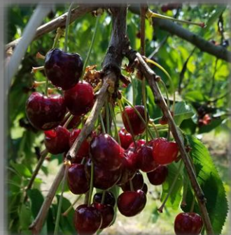
The cherry trees provided abundant fruit and easy picking.