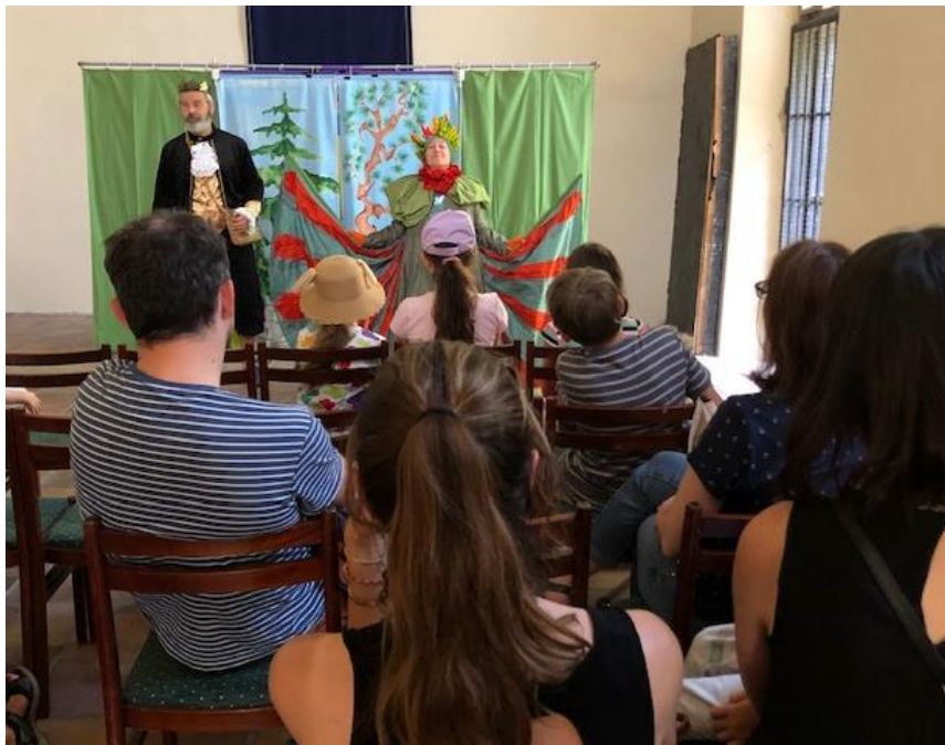
The children from the congregation, along with friends and a few parents, were entertained by a small theater production about kindness, helpfulness and friendship.

Since life has returned to normal in Prague, with all Covid restrictions lifted, the Evangelická církev augsburského vyznání v České republice (ECAVvČR) held a Czech congregation day on Saturday, June 18. Many of our members live up to an hour away from church, so they enjoyed having a whole day together. With so few Christians in the Czech Republic, it is also very important to foster fellowship opportunities in addition to Sunday church services.