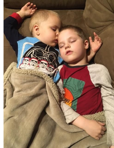
A few extra day naps on the couch while adjusting to the time change.