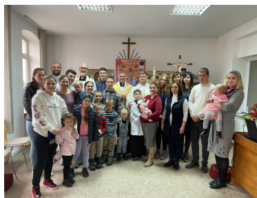
A group photo with Americans, Romanians, and Ukrainians after Easter service. Praise be to God!