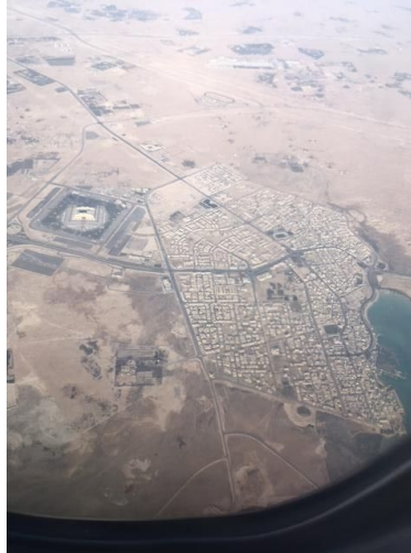
Picture from the airplane window while flying over the Middle East.