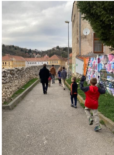
Walking to church. The church building we are renting is about 1.5 km from our house.