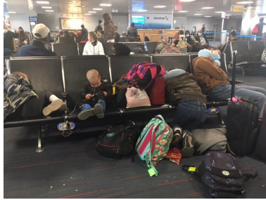
All were very tired after a sleepless night, and this was taken during our layover in NYC.