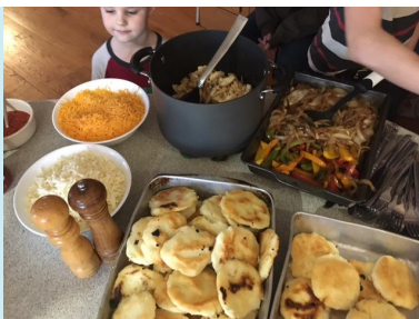
In March, I made Venezuelan arepas for our Wyoming family as a final meal before we left.