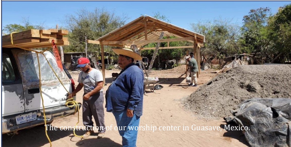
The construction of our worship center in Guasave, Mexico.

To support our work financially, you may send a tax-deductible gift to: