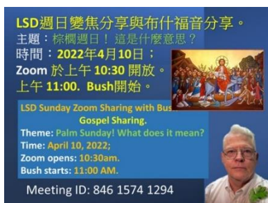
Figure 6. This is an invitation to attend the 30-minute Sunday Zoom devotion sent to LSD students and staff when the Chapel services at LSD were suspended. I prepared Zoom a devotion and PowerPoint Bible lesson using English and Chinese. One of the teachers would interpret into Cantonese and Hong Kong Sign Language. I would sign in American Sign Language for my wife. +++