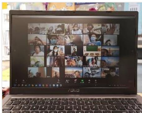
Figure 7. After several months, the final 30-minute Sunday Zoom devotion was shared on Easter Sunday. There was over 21 persons watching. We started with 3 students. +++