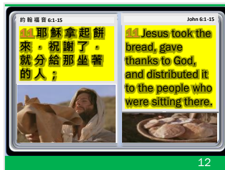
Figure 2. WHO IS JESUS? Jesus-feeder of the 5000. Jesus demonstrates His ability to take seven small loaves of bread and multiply them in such a way that over 5000 people could eat until they are full.

deaf to learn from the Zoom lessons. And in the classroom with face-to-face instruction, the teachers wear masks so that half of the face is not visible to the students who need to see the movement of the lips to understand what is being said.