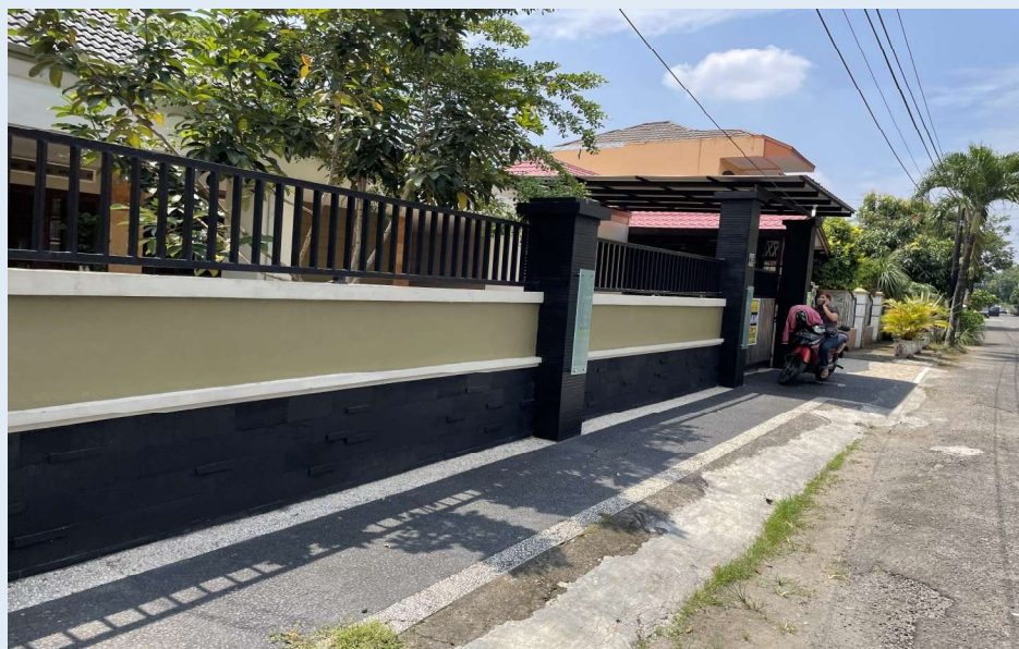
Looking down the street past our house on the first day we saw it, just over a month ago!

She doesn't wear the traditional Muslim head scarf. Since religion is a common conversation starter, I have no doubt we'll soon know more about her background, and have the chance to share about our hope in the resurrected Son of God. Thank you for your support to make such conversations possible!