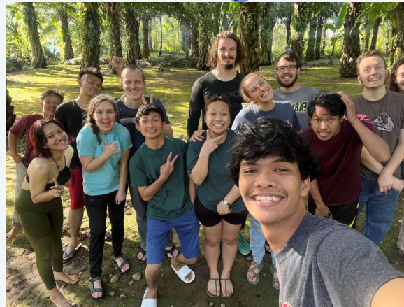
↑ A hike with friends from our language school