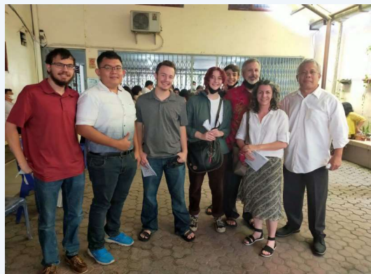
↑ Easter service at church with friends