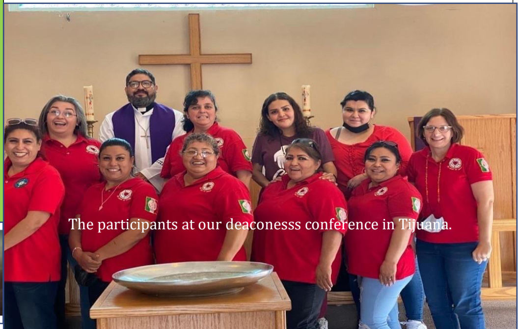
The participants at our deaconess conference in Tijuana.