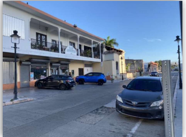
Panadería (Bakery) San Agustín Our neighborhood bakery who we visit daily and pray for.