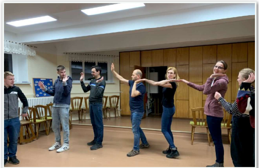
Above: Every Friday during Lent our youth group attends the Lenten service together, invites the weekly guest pastor to share during our devotion time and then we engage in some special program. Here we are learning some traditional dances!