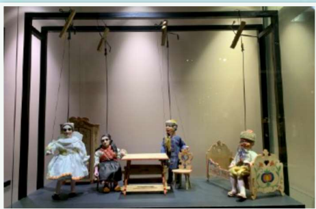
Marionette puppets from a museum exhibit I visited in Opava, Czech Republic.

During the mid-18th century, Czech puppetry (specifically marionette puppets) became a cultural phenomenon around the Czech lands. Puppeteer families would make puppets usually carved out of wood, go to a city, set up a booth, and put on puppet shows for the community. Today there are nine professional puppet theaters keeping this mode of story telling alive in the Czech Republic. This month I visited one amateur theater and saw a typical Czech fairy tale performed with marionette puppets. I would give the performance a 10 out of 10, and I will definitely go to another puppet show soon!