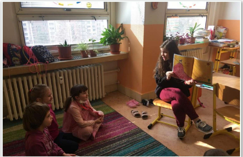
Above: First graders listen to a story and sing along with the book, reviewing numbers and colors in English.