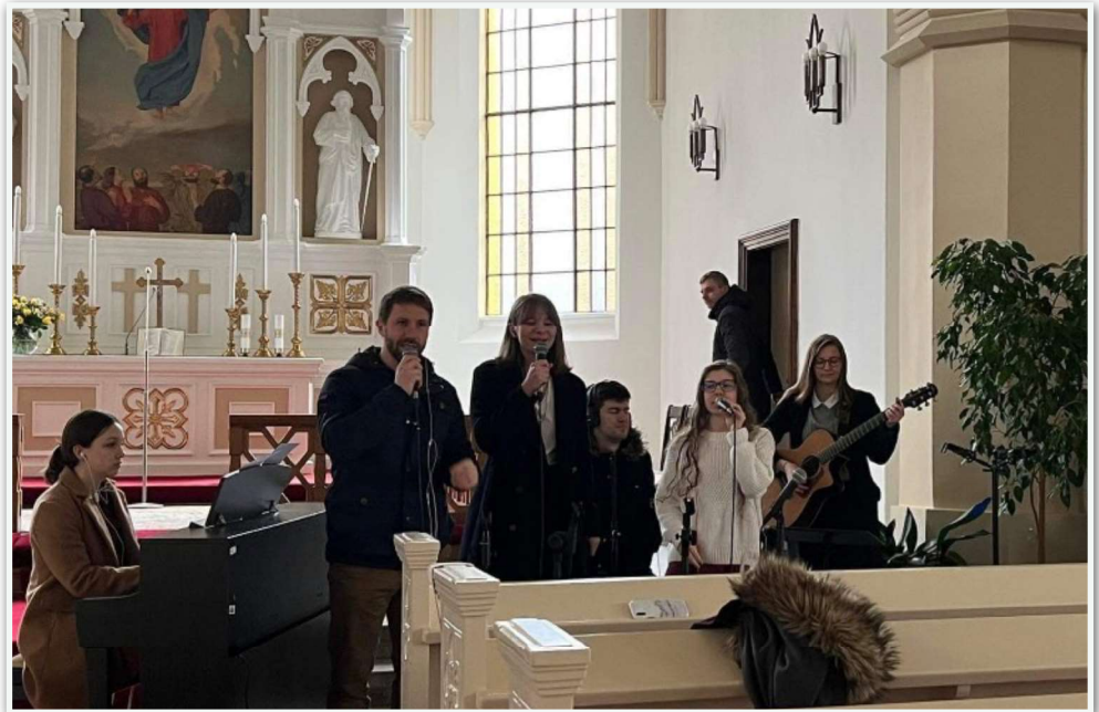
Above: Our band rehearses before playing for the monthly youth service at church.