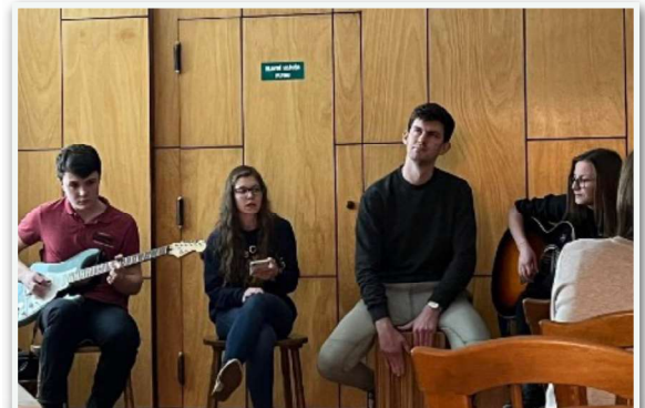
To the right: Our band leading music at youth group.

I am thankful for the warm welcome I have received so far in Český Těšín and the friendships I am beginning to build here.