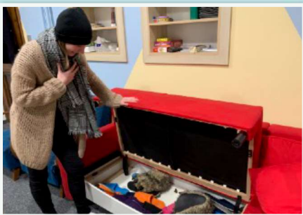
This drawer is kept full of slippers at church for those entering the room for Bible Study or youth group.

When you come in the house, you take off your shoes. Maybe this is a common practice for you. In the Czech Republic, home slippers or paupcie as they are called in the local dialect, are a very common thing to be offered when you enter someone's home. It is even common for the host to have a basket of slippers to offer so the guest does not have to bring their own. When I arrived two years ago, my roommate made it a point to take me "home shoes" shopping as she saw it was a necessity. Whenever we have a youth lock-in, I am sure to bring my slippers along with me for the night.