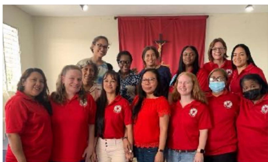
Studying mercy and the role of the deaconess with these deaconess students.

The fun continues with the women in Pueblo Nuevo! We are meeting once a month for Bible study, crafts, and food. We even made some banners to go with our Lenten theme this year from Isaiah 53. We also had a WhatsApp group to share daily devotions for Lent. We have been gathering a food offering on the first Sunday of every month and the smiles of those who receive the food fill my heart with joy. The joy increases with the Saturday Bible school which continues to do very well. We celebrated Easter with 35 kids. We reviewed the events of Holy Week, sang, and colored Easter