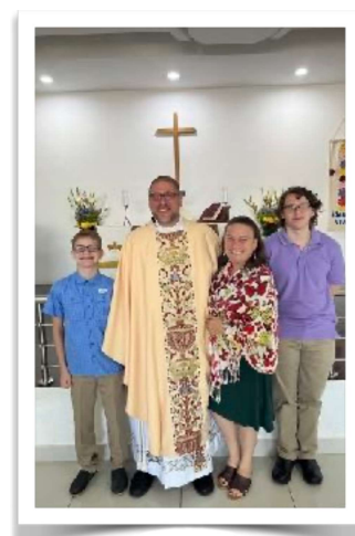
Easter 2022 family pic