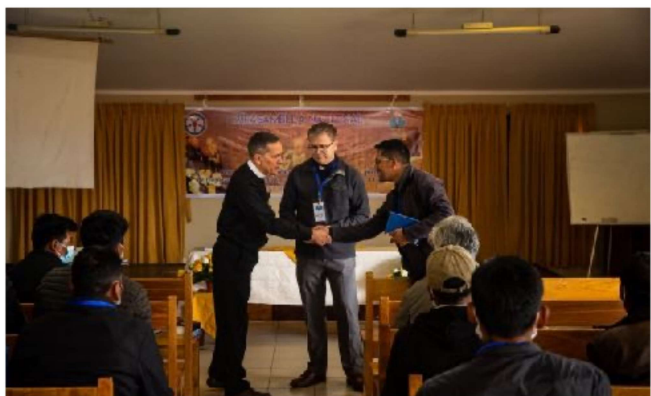
Luther's Small Catechism in the Quechua language is formally presented to the Bolivian church

years, but were either not formally ordained or had been ordained without a full subscription to the Book of Concord . For the last two years we have worked hard with the Bolivian pastors, teaching them especially about the theology of ministry, ordination and church order. Our DR seminary faculty played a foundational role in this, never telling them what to believe, rather what we believe, teach and confess according to the Scriptures and Lutheran Confessions. God be praised, the Bolivian pastors penned a document that is their confession on the Office of the Holy Ministry. The two men ordained back in 2020 were ordained with a full subscription to the Book of Concord . Back then in 2020, the pastors made the decision to pursue ordination with a full subscription to the Book of Concord for the remaining pastors. At our most recent visit, their document on the ministry was