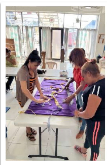
Making Lenten banners for the church; by His wounds, we are healed! .