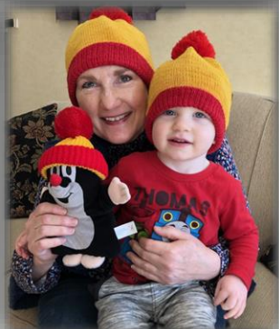
Knit hats match the one worn by "krteček" for sledding.