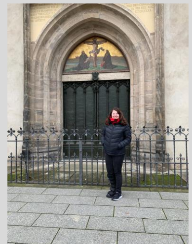
While in Germany, I was able to take some time to visit some historical Luther sites