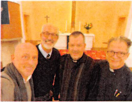
Operation Overlord team brainstorming at Trinity Lutheran, Berlin, Germany.