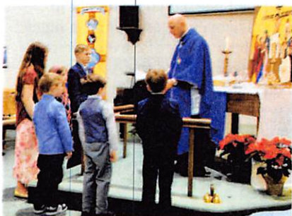
Serving the Lord for Eurasia