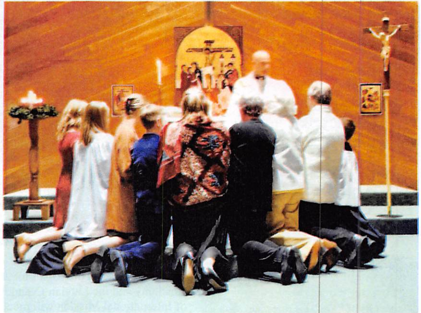
Three generations commune with Jesus Christ on Christmas Eve.