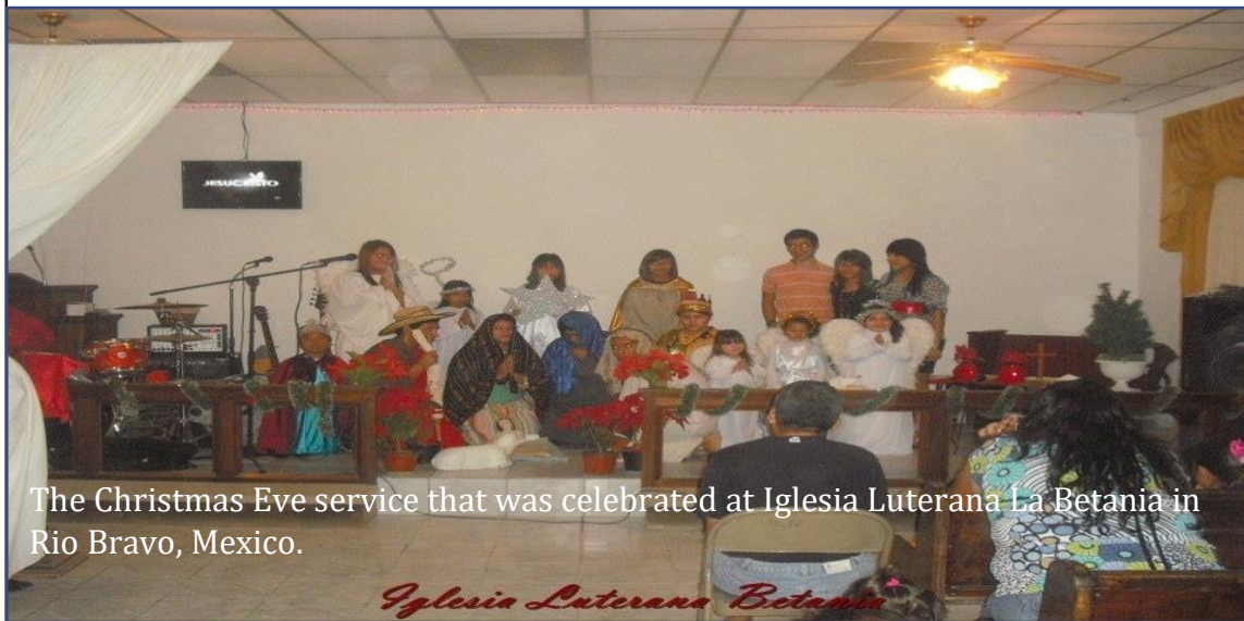
The Christmas Eve service that was celebrated at Iglesia Luterana La Betania in Rio Bravo, Mexico.

To support our work financially, you may send a tax-deductible gift to: