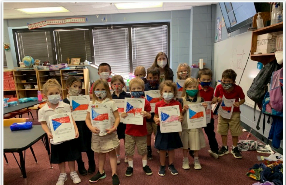
Above: Kindergarteners at Trinity, Atchison, KS display Czech flag drawings.

“A missionary is someone who tells other people about Jesus”, a kindergartener said proudly. This was the beginning of what I shared with the students at Trinity Lutheran School in Atchison, Kansas. We discussed sharing Jesus with our friends, living in another country, and learning a new language.