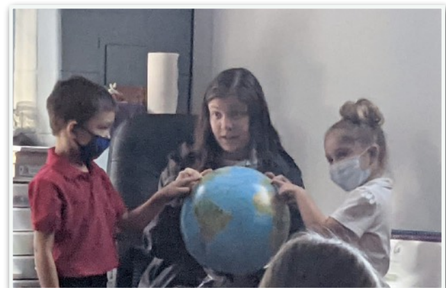
Above: Students learn where the Czech Republic is located.