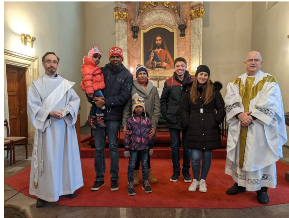
Transfiguration Sunday (24 January) also served as the time to welcome two new families