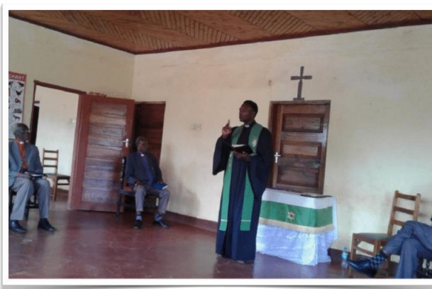
Chapel at St. Peter Seminary, September 2020