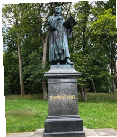
Martin Luther statue in Aš

On the last weekend of July, I traveled by train with six other members of the English congregation in Prague to western Bohemia. We stayed in the city of Cheb and visited the nearby city of Aš which has the only statue of Martin Luther in all of the Czech Republic.