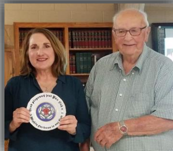
Dad and I at St. John's Browns Corners in October 2019.