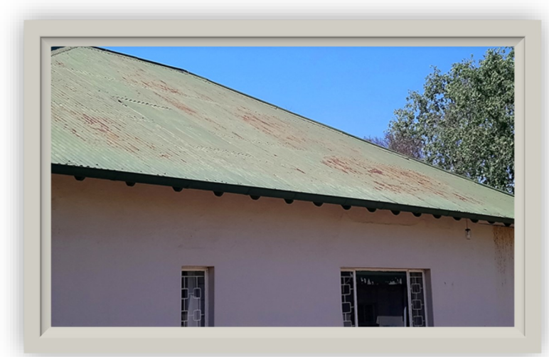
One of the roofs that needs to be repainted