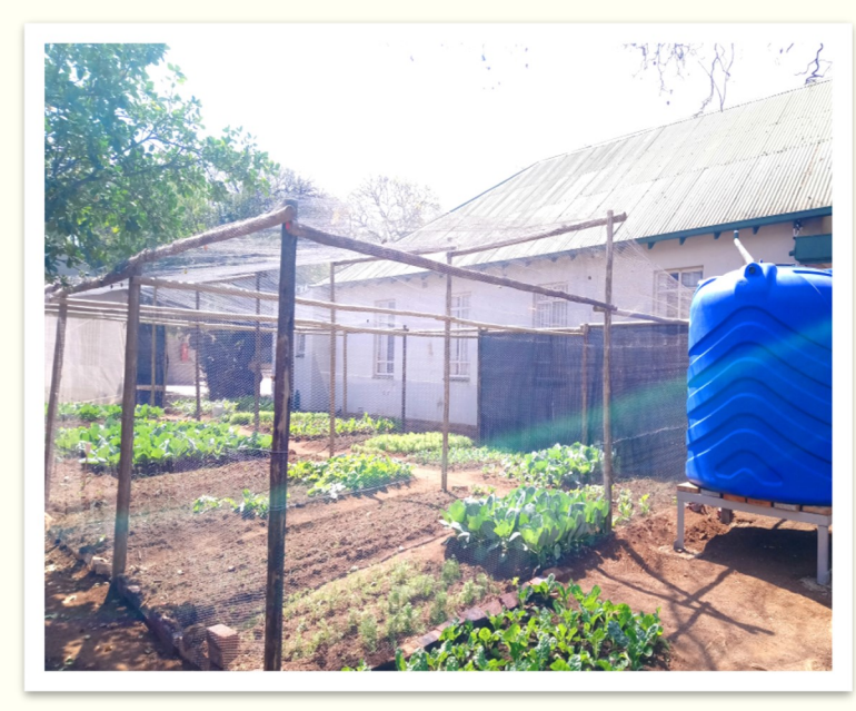
The new rainwater tank at the enclosed vegetable garden

The beds have been enclosed with chicken mesh (picture right) to protect the vegetables from birds and hail. A water tank has also been installed to harvest rainwater for the irrigation of the vegetables. Students are diligently working in the garden with good results. Some of the vegetables are used when lunch is cooked. We again thank