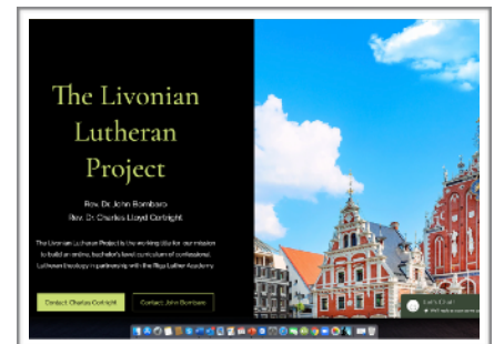
Our new website homepage

I haven’t just been sitting around, however! July and August are always busy months of preparation for fall and for other projects. In the latter category has been the creation of a website for our work here in Rīga. As