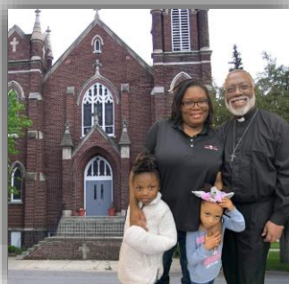
Standing across from the front of St. John's Evangelical Lutheran Church