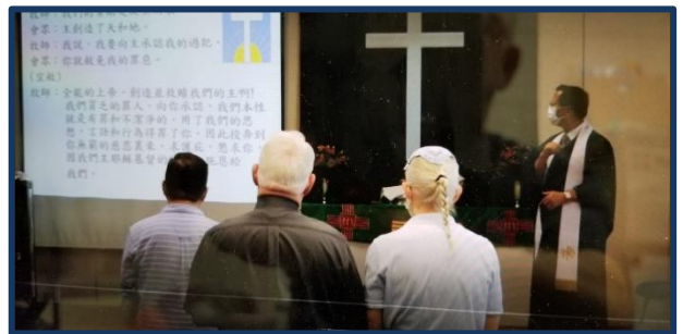
Sunday morning worship resumed for about 6 weeks until July 12 th , when services were canceled again because of a new outbreak of the coronavirus in Hong Kong.