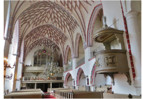
St. John's interior

copies of LSB given to us by the Eurasia mission office in Prague ( Děkuju! ).