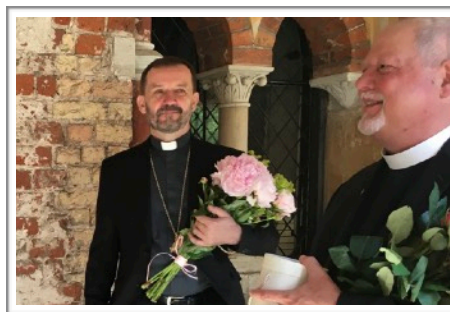
Flowers for the teacher

After the service, a reception for all was held in the inner garden of the cathedral; in keeping with local custom, flowers were